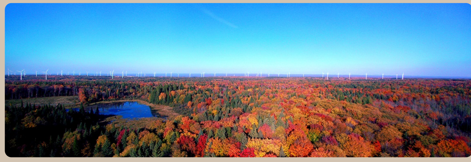
Wind Power and Fall Foliage on Tug Hill Plateau.