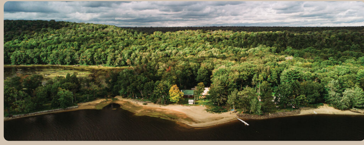
Upper Salmon River Reservoir.