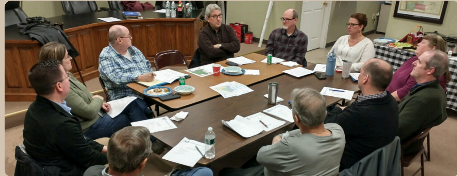
Tug Hill Commissioners.