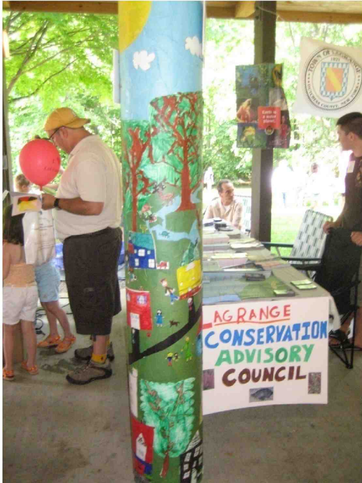
LaGrange Community Day