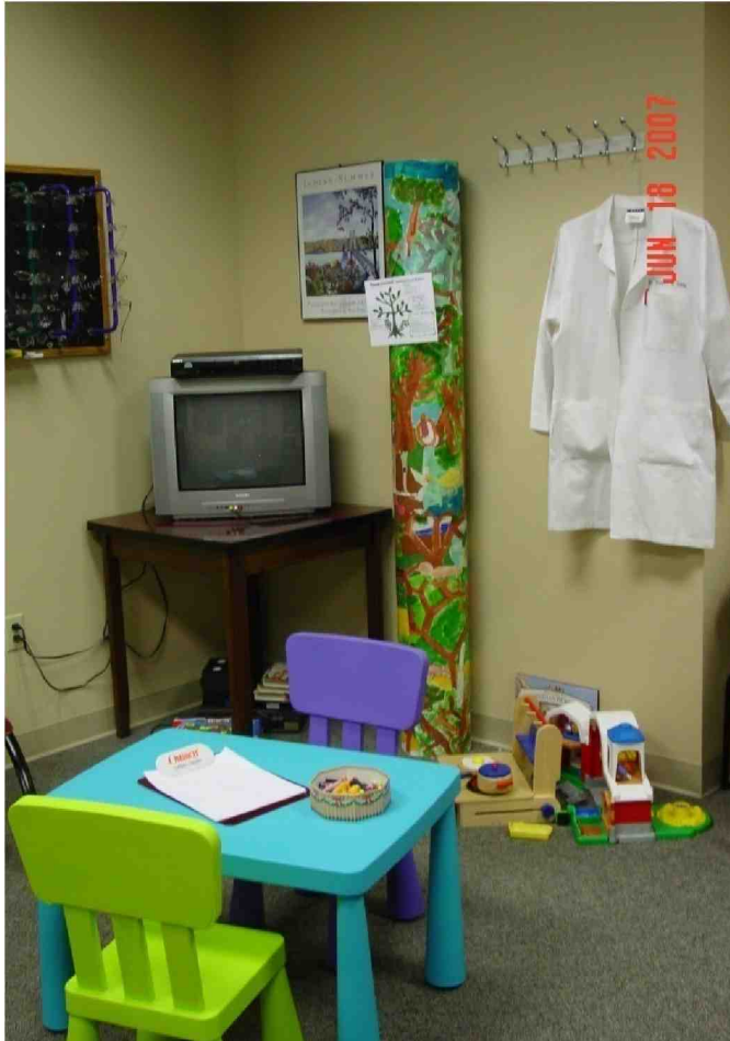
LaGrange Eye Care