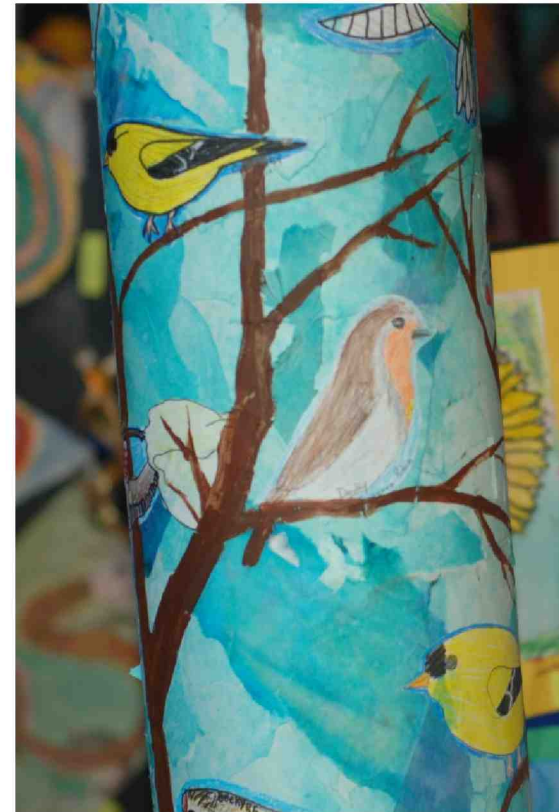
LaGrange Art Show