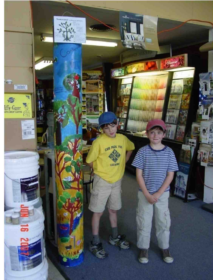
Hudson Valley Paint