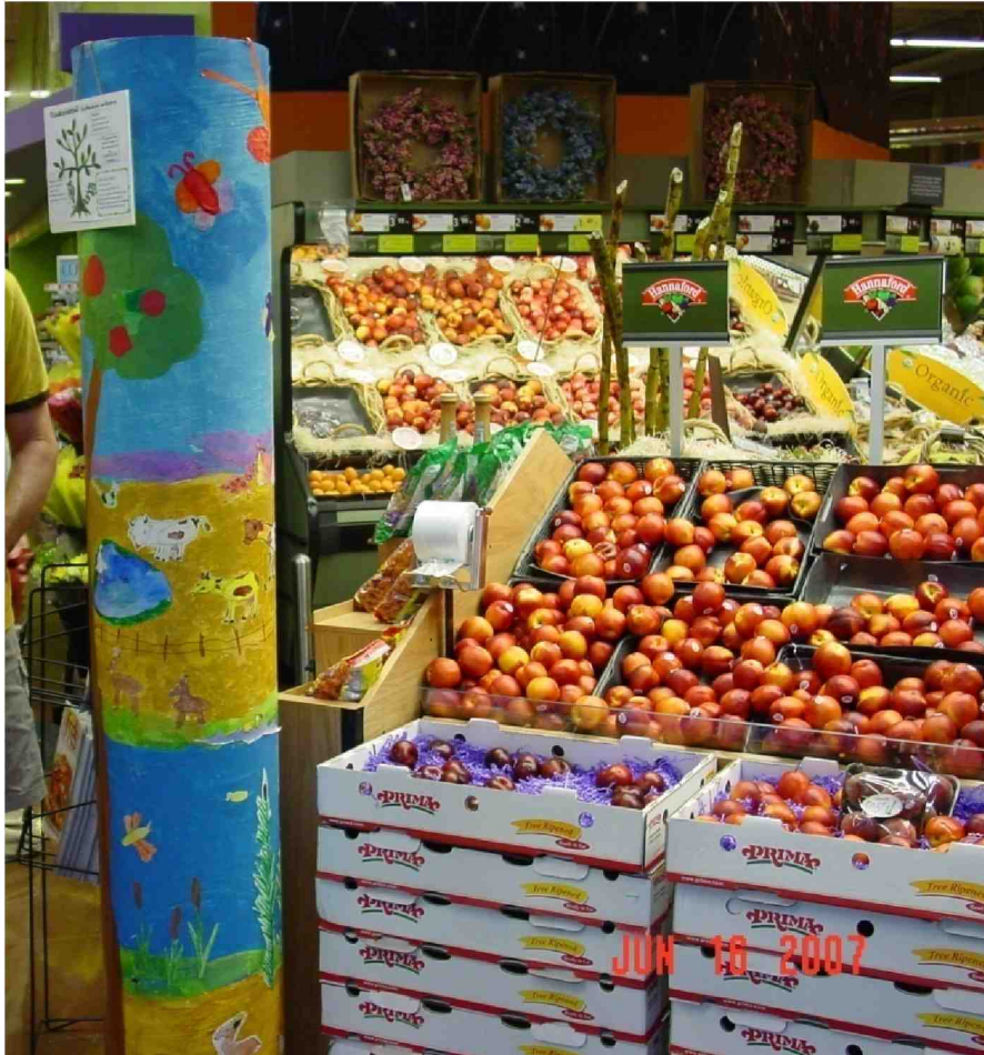
Hannaford's Grocery Store